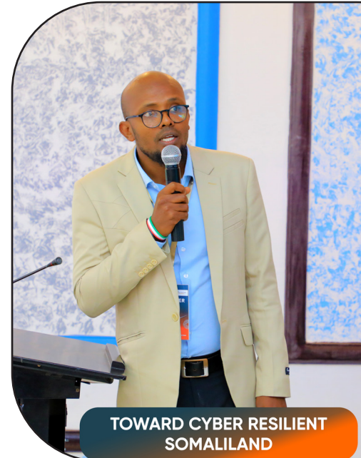
TOWARD CYBER RESILIENT SOMALILAND