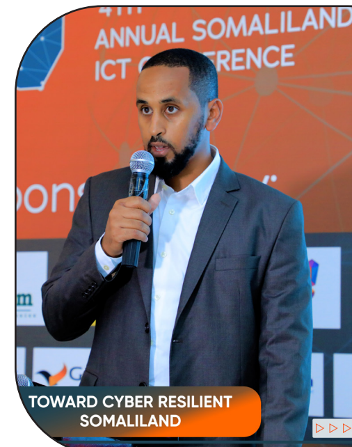
TOWARD CYBER RESILIENT SOMALILAND